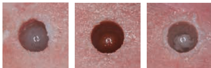
Osteotomy created with standard drills

Introducing Densah Bur Technology for implant osteotomy preparation from Versah™ LLC. Densah Burs have a non-excavating proprietary flute design that, when rotating at 800 – 1500 rpm in reverse, densifies bone. This technique, known as Osseodensification, autografts bone along the entire length of the osteotomy through a hydrodynamic process with the use of irrigation. When rotating clockwise, Densah Burs also precisely cut bone. The result is a consistently cylindrical and densified osteotomy. Consistent osteotomies and densification are important to implant primary stability and to early loading.