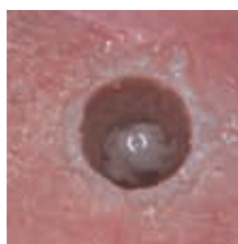
Osteotomy created with Densah Bur Osseodensification

To order the newest innovation in implant dentistry, contact a Versah Customer Service Professional at 844-711-5585 or visit www.versah.com